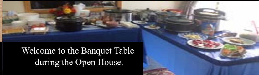
Welcome to the Banquet Table during the Open House.

Please fill out the form at the bottom of the last page and return it in the enclosed envelope BEFORE Sharathon 2017 starts on November 14th. Please remember... what you do today determines what the NewVision FM Radio Ministry is able to do tomorrow!